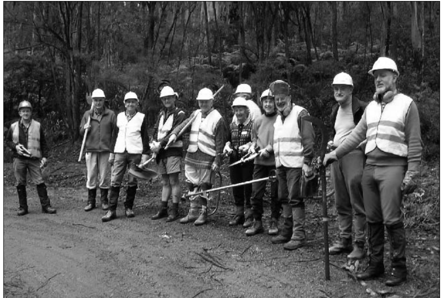
Freemans Mill Track clearing team