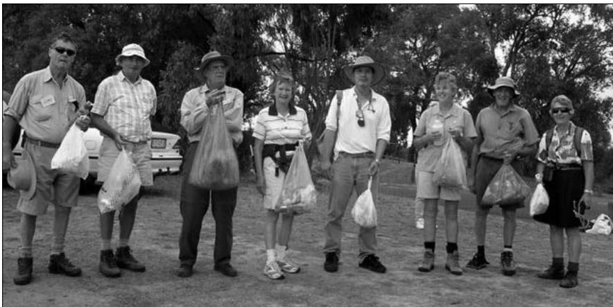
A group of dedicated Waverley Bushwalking Club 'garbos' with their collections during one of their March walks