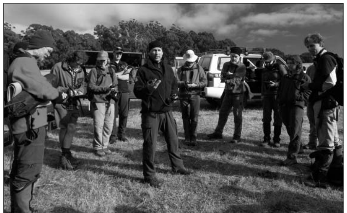
BSAR practice participants receive a briefing from Police SAR on the use of radios