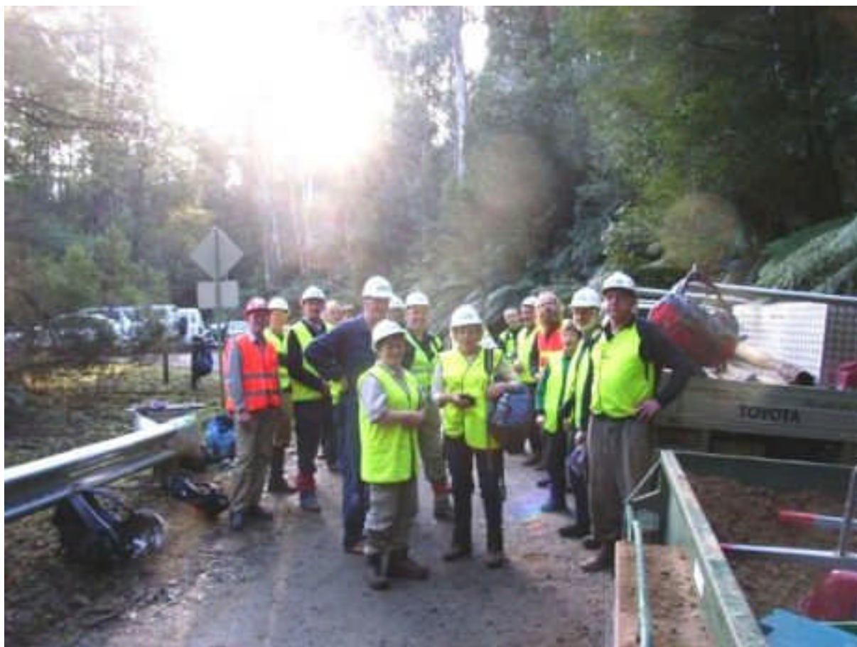
Beeches Track Maintenance Group